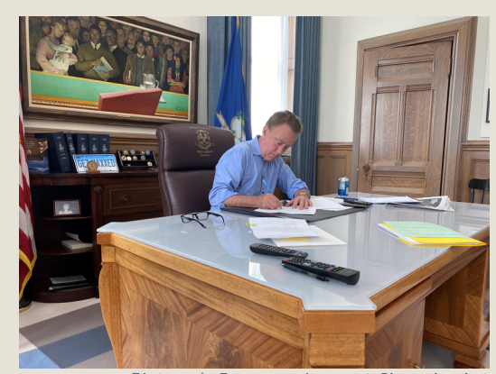
Pictured: Governor Lamont Signs An Act Concerning Telehealth

This legislation extends for two years the telehealth provisions that Governor Lamont issued in March 2020 due to the COVID-19 pandemic, including parity in payment for services and the allowance of audio-only telehealth. The legislation requires the Department of Public Health to study the benefits and implications of expanding telehealth services in the state by 1/1/22.