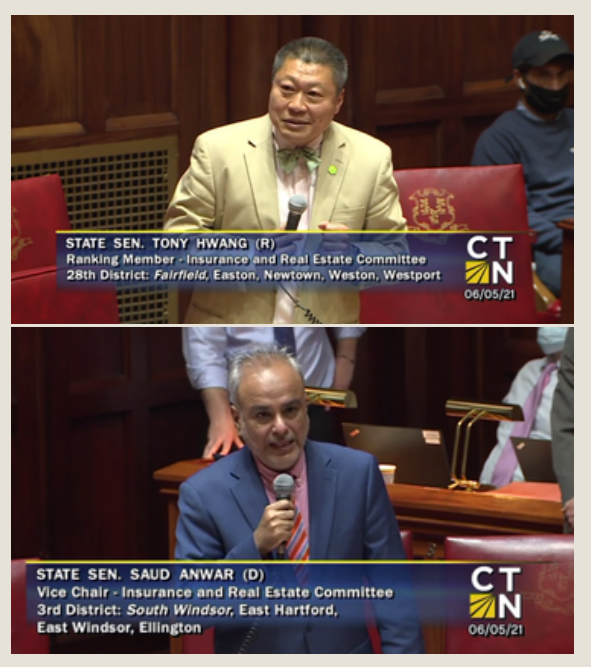
Pictured: Sen. Tony Hwang and Sen. Saud Anwar speaking in support of the legislation.

Why is this important? When health plans change their formularies during the plan year, it can leave a patient without a suitable drug alternative or having to pay a much higher out-of-pocket cost for necessary drugs. Physicians, not insurers, should determine which medications their patients take. This important legislation helps to ensure that physicians are able to prescribe the appropriate medications for their patients without being subject to the formulary change games that insurers often play.