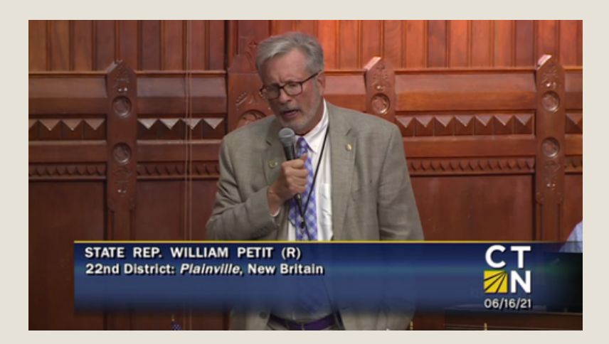
Pictured: Rep. Bill Petit speaking against the legislation on the House floor.

vehemently opposes the legalization of recreational marijuana. There are significant concerns about the lack of scientific evidence that supports recreational use by adults. Marijuana is an addictive drug that can have significant adverse public health impacts when legalized. CSMS supports and recognizes the need for decriminalization efforts and reduced penalties for cannabis offenses, as we have seen wide racial disparities related to convictions for marijuana possession. We will continue to inform Connecticut policymakers about the health and social ramifications in future legislative sessions.